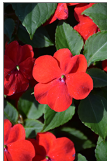
Beacon Bright Red Impatiens flowers

Beacon Bright Red Impatiens is recommended for the following landscape applications;