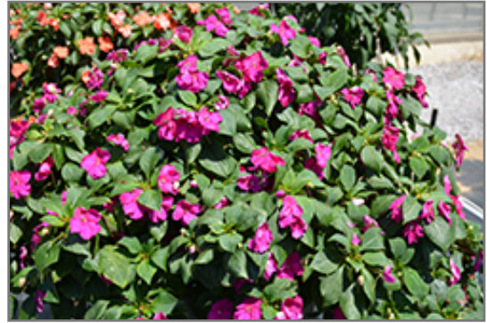
Beacon Violet Shades Impatiens in bloom

Beacon Violet Shades Impatiens will grow to be about 15 inches tall at maturity, with a spread of 12 inches. When grown in masses or used as a bedding plant, individual plants should be spaced approximately 8 inches apart. Its foliage tends to remain dense right to the ground, not requiring facer plants in front. This fast-growing annual will normally live for one full growing season, needing replacement the following year.