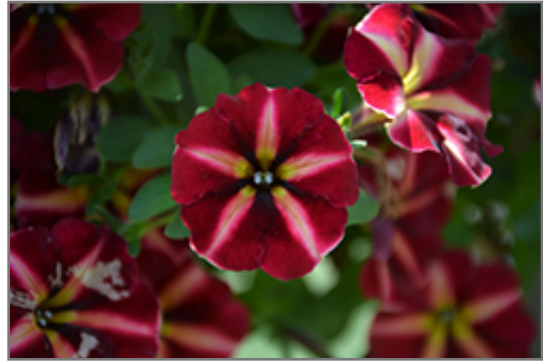
ColorRush Merlot Star Petunia flowers

ColorRush Merlot Star Petunia will grow to be about 12 inches tall at maturity, with a spread of 30 inches. When grown in masses or used as a bedding plant, individual plants should be spaced approximately 24 inches apart. Its foliage tends to remain dense right to the ground, not requiring facer plants in front. This fast-growing annual will normally live for one full growing season, needing replacement the following year.