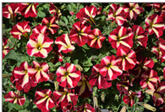
ColorRush Merlot Star Petunia flowers

ColorRush Merlot Star Petunia is recommended for the following landscape applications;