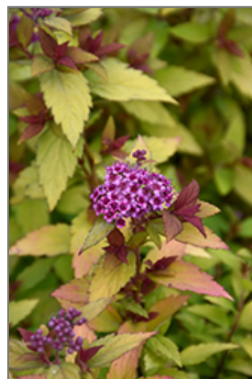
Poprocks Rainbow Fizz Spirea flowers