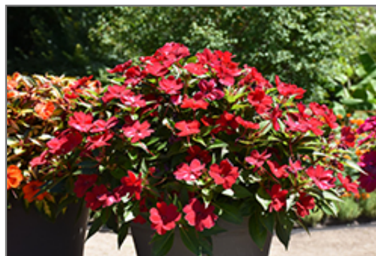
SunPatiens Vigorous Red Impatiens in bloom