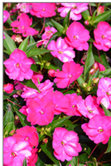
SunPatiens Vigorous Rose Pink New Guinea Impatiens flowers

This plant will require occasional maintenance and upkeep, and should not require much pruning, except when necessary, such as to remove dieback. It has no significant negative characteristics.