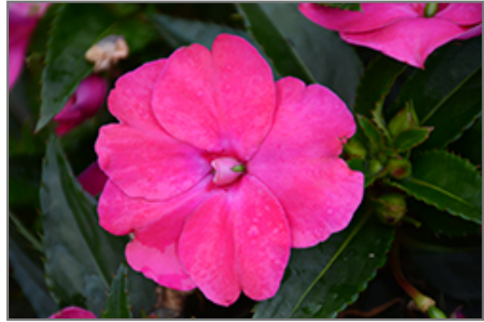
SunPatiens Vigorous Rose Pink New Guinea Impatiens flowers

SunPatiens Vigorous Rose Pink New Guinea Impatiens is a fine choice for the garden, but it is also a good selection for planting in outdoor containers and hanging baskets. Because of its height, it is often used as a 'thriller' in the 'spiller-thriller-filler' container combination; plant it near the center of the pot, surrounded by smaller plants and those that spill over the edges. It is even sizeable enough that it can be grown alone in a suitable container. Note that when growing plants in outdoor containers and baskets, they may require more frequent waterings than they would in the yard or garden.