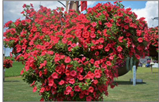
ColorRush Watermelon Red Petunia in bloom

ColorRush Watermelon Red Petunia will grow to be about 12 inches tall at maturity, with a spread of 30 inches. When grown in masses or used as a bedding plant, individual plants should be spaced approximately 24 inches apart. Its foliage tends to remain dense right to the ground, not requiring facer plants in front. This fast-growing annual will normally live for one full growing season, needing replacement the following year.