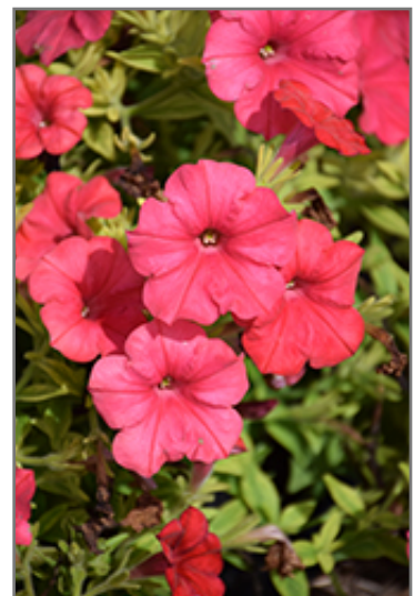
ColorRush Watermelon Red Petunia flowers