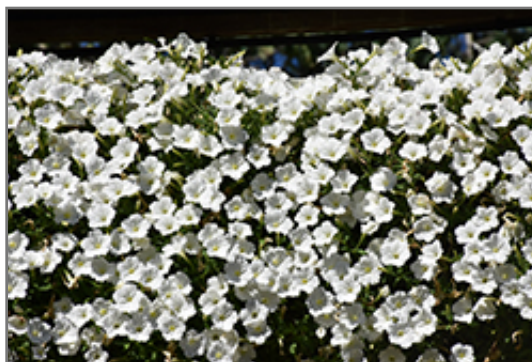
ColorRush White Petunia in bloom

ColorRush White Petunia is recommended for the following landscape applications;