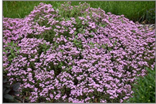
Rock Soapwort in bloom

Rock Soapwort is a fine choice for the garden, but it is also a good selection for planting in outdoor pots and containers. Because of its spreading habit of growth, it is ideally suited for use as a 'spiller' in the 'spiller-thriller-filler' container combination; plant it near the edges where it can spill gracefully over the pot. Note that when growing plants in outdoor containers and baskets, they may require more frequent waterings than they would in the yard or garden. Be aware that in our climate, most plants cannot be expected to survive the winter if left in containers outdoors, and this plant is no exception. Contact our experts for more information on how to protect it over the winter months.