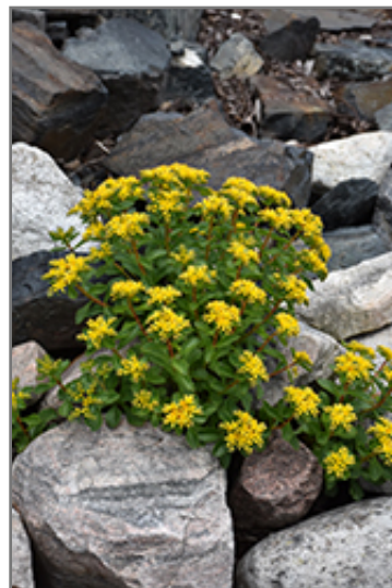
Russian Stonecrop in bloom