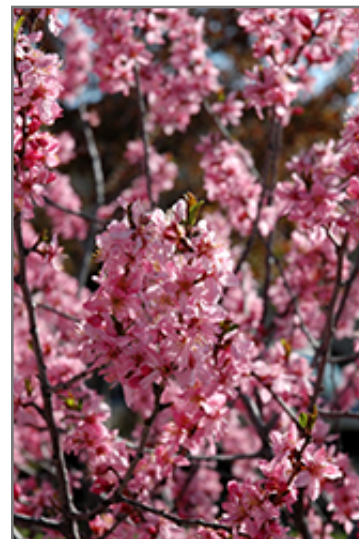
Muckle Plum (tree form) flowers