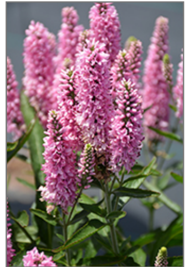
Skyward Pink Long-leaf Speedwell flowers

This plant is not reliably hardy in our region, and certain restrictions may apply; contact the store for more information.