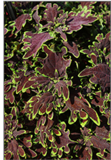
Limewire Coleus foliage