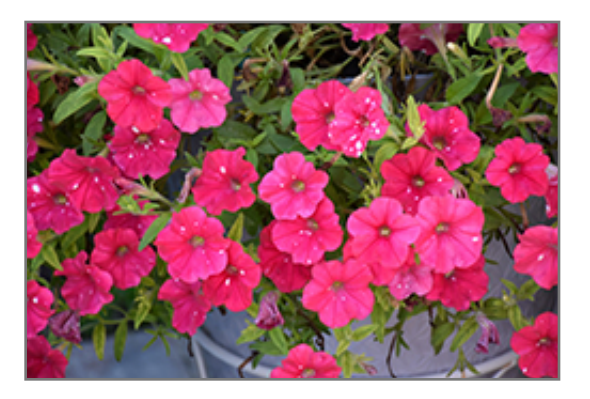
HeadlinerStrawberry Sky Petunia flowers