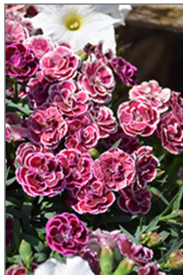
SuperTrouper Lilac on Purple Carnation flowers

Double, lilac and red miniature carnations with frilly purple petal edges bloom consistently over a long season, especially in warmer climates; great for border fronts, containers, and floral arrangements