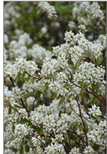
Saskatoon flowers

Saskatoon is a multi-stemmed deciduous shrub with an upright spreading habit of growth. Its relatively fine texture sets it apart from other landscape plants with less refined foliage.