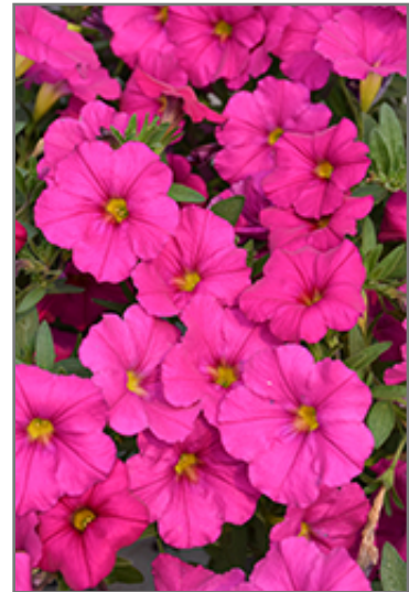
EnViva Pink Petchoa flowers

EnViva Pink Petchoa is recommended for the following landscape applications;