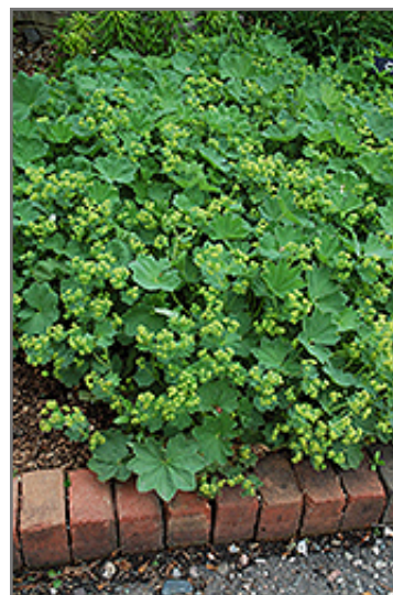
Thriller Lady's Mantle in bloom