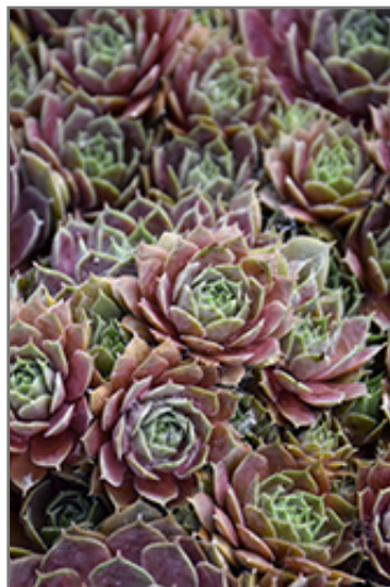
Purple Beauty Hens And Chicks