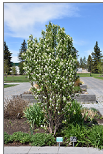
Standing Ovation Saskatoon Berry in bloom