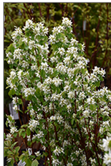
Standing Ovation Saskatoon Berry flowers