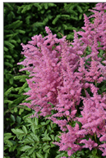
Visions in Pink Chinese Astilbe flowers

Visions in Pink Chinese Astilbe is recommended for the following landscape applications;