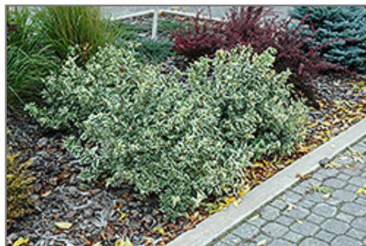
Cool Splash Bush Honeysuckle