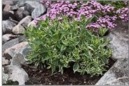
Cool Splash Bush Honeysuckle

This plant is not reliably hardy in our region, and certain restrictions may apply; contact the store for more information.