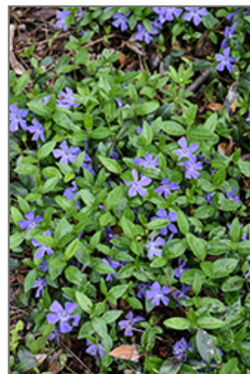
Common Periwinkle flowers