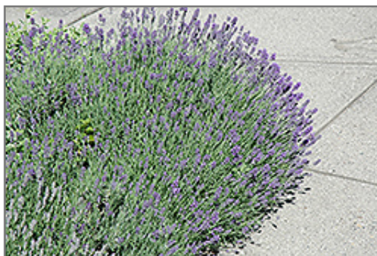
Munstead Lavender in bloom