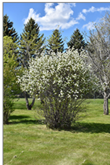
Smokey Saskatoon in bloom

Smokey Saskatoon is bathed in stunning clusters of white flowers rising above the foliage from early to mid spring before the leaves. It has dark green deciduous foliage. The oval leaves turn an outstanding yellow in the fall. It features an abundance of magnificent blue berries in late spring.