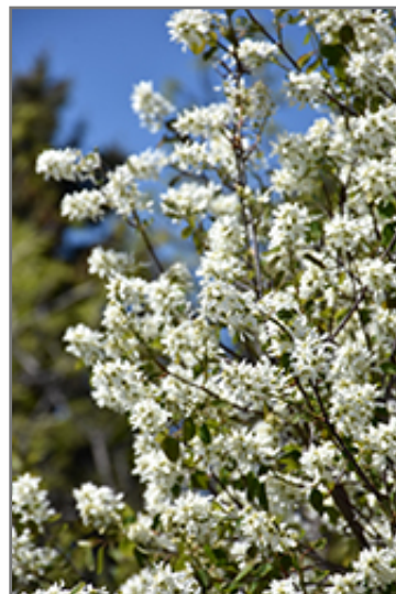
Smokey Saskatoon flowers