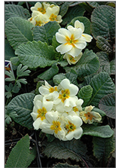
Wanda Primrose flowers

Wanda Primrose is recommended for the following landscape applications;