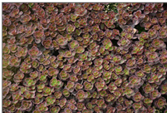
Bronze Carpet Stonecrop foliage